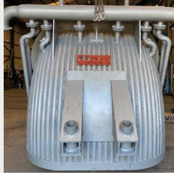
Water- Cooled Equipments for Steel Plants; Duct, Elbow, Reduction