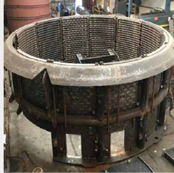
Water- Cooled Equipments for Steel Plants; Roof, Upper Sheel, Center Ring