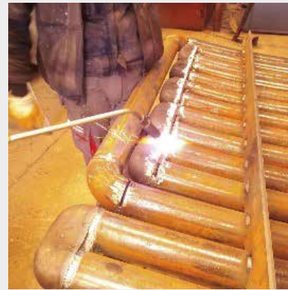
Water Cooled Panels Uppershell panel, EBT (copper) Panels, Combustion Chamber Panels,CCM Panels